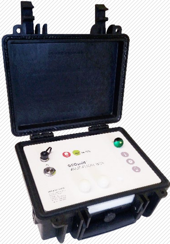
GEOsniff® VALIDATION-BOX with 3x GEOsniff® Test balls