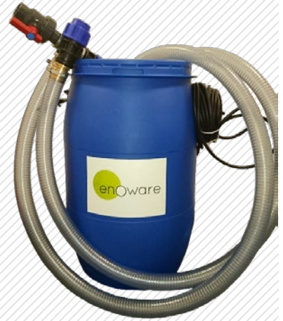
1x barrel with manual BYPASS and submersible pump