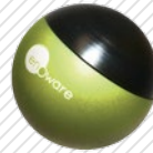
1x GEOsniff® MEASUREMENT PIG